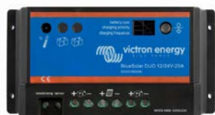
BlueSolar PWM-DUO 12/24-20