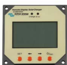
Remote display for BlueSolar DUO 12/24-20